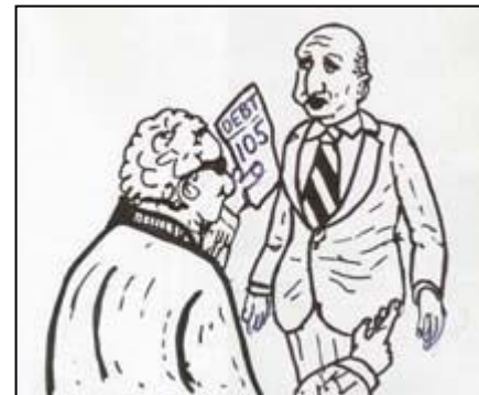
Fabian visited all the people who owed him money...

The others discovered for the first time that they had a debt. Before he would lend them more money, Fabian took a mortgage over some of their assets, and everyone went away once more to try and get those extra 5 coins which always seemed so hard to find.