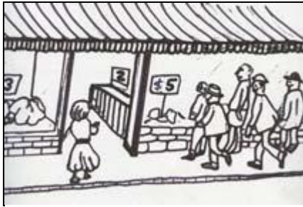
...genuine free competition.

In one town lived Alan, who was the only watchmaker. His prices were high because the customers were willing to pay just to own one of his watches.