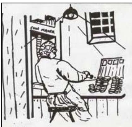
Fabian wasted no time...

"Since I am providing a service, that is, the money supply, I am entitled to payment for my work. Let us say that for every 100 pieces you obtain, you repay me 105 for every year that you owe the debt. The 5 will be my charge, and I shall call this charge interest."