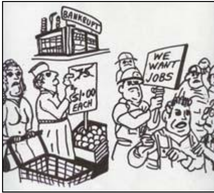
As things got worse...

Merchants were forced once again to raise their prices. Wage earners demanded higher wages forcing many employers out of business, or to replace men with machinery. This caused additional unemployment and forced the Government to introduce further welfare and handout schemes.