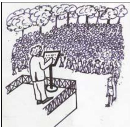
The next day there was a great assembly...

The next day there was a great assembly in the town square and Fabian explained all about the new system which he called "money". It sounded good. "How are we to start?" the people asked.