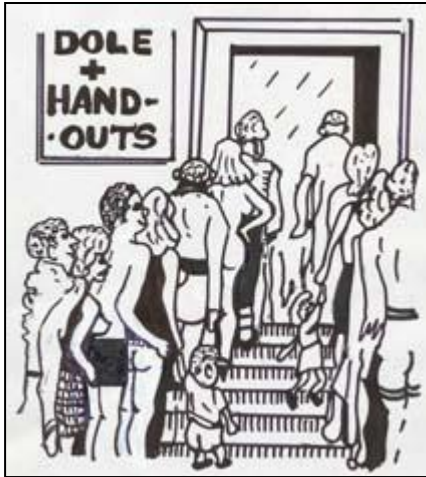
They started up welfare schemes...

They started up welfare schemes and made laws forcing people to contribute to them. This made many people angry - they believed in the old-fashioned idea of helping one's neighbour by voluntary effort.