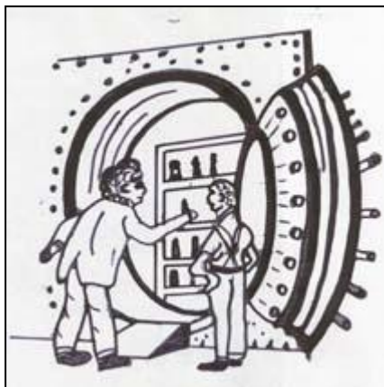
At the back of his shop Fabian had a strongroom...

No one realised that as a whole, the country could never get out of debt until all the coins were repaid, but even then, there were those extra 5 on each 100 which had never been lent out at all. No one but Fabian could see that it was impossible to pay the interest - the extra money had never been issued, therefore someone had to miss out.