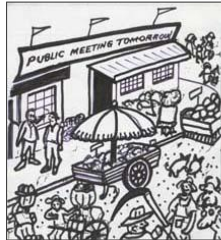
Market day was always noisy and dusty...

Generally, the people had been happy, and enjoyed the fruits of their work.