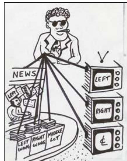
To do this Fabian purchased most of the newspapers, TV and Radio stations...

Fabian's plan was almost at its completion - the whole country was in debt to him. Through education and the media, he had control of people's minds. They were able to think and believe only what he wanted them to.