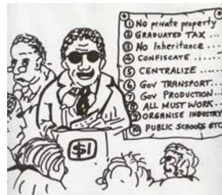
Introduce a system of taxation.