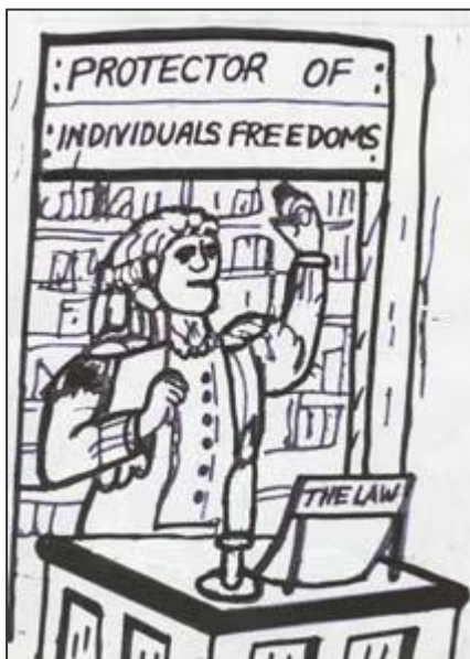
This was the Government's one and only purpose...

In each community a simple Government had been formed to make sure that each person's freedoms and rights were protected and that no man was forced to do anything against his will by any other man, or any group of men.